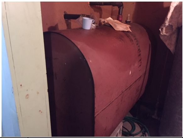
Photo CPAI Area #07 – 275-gallon Above #5: Ground Storage Tank (assumed #2 fuel oil)