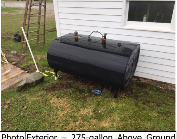
Photo Exterior – 275-gallon Above Ground #8: Storage Tank (assumed Kerosene)